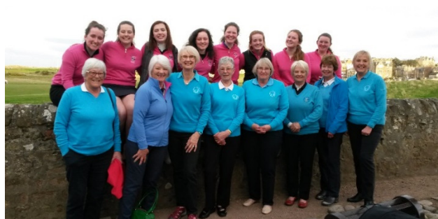
VICTORIOUS Carnoustie Ladies Team at St Andrews.